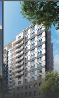
The Reserve at Falls Church FALLS CHURCH, VA