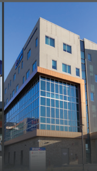
Intermountain Health Lutheran Medical Office Building WHEAT RIDGE, CO