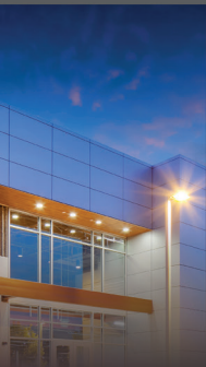
HATCHlabs @ Irvine Spectrum IRVINE, CA