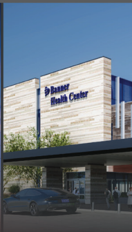
Banner Health Center SCOTTSDALE, AZ